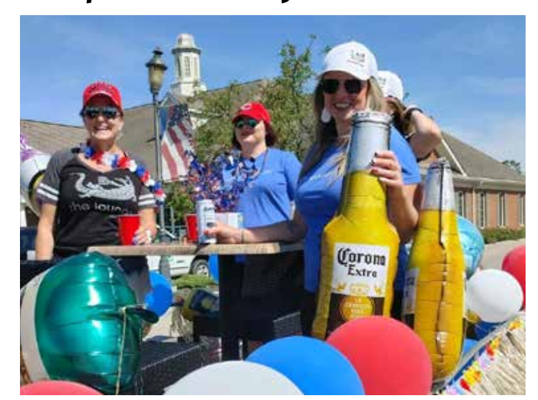
Most Spirited - Sponsored by Mercy Health - The Lounge