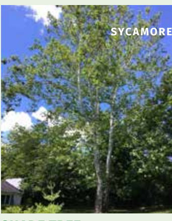
SHADE TREE Sycamore 1144 Altadena Ave.