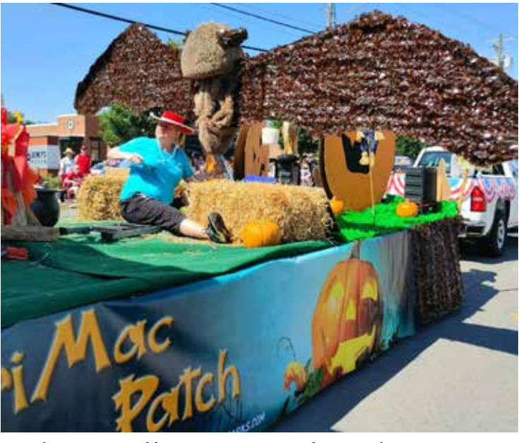
Best Float - Sponsored by Core Resources - Anderson Park District