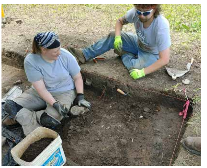
Field School students excavate a test unit.