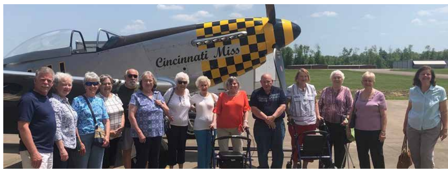
Trip to Tri-State Warbird Museum

Upgrades at center lead to new programs, more members, lots of fun.