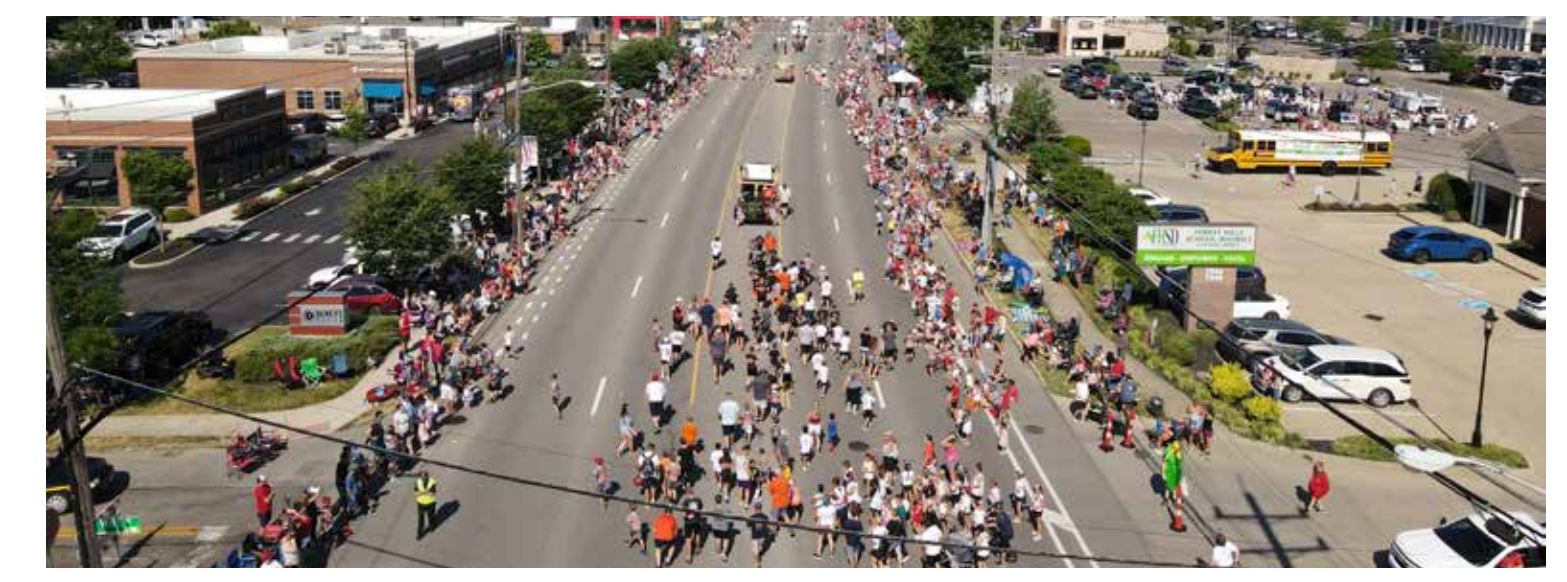
Best Neighborhood or Organization - Sponsored by the Anderson Towne Center - Anderson Wildcats