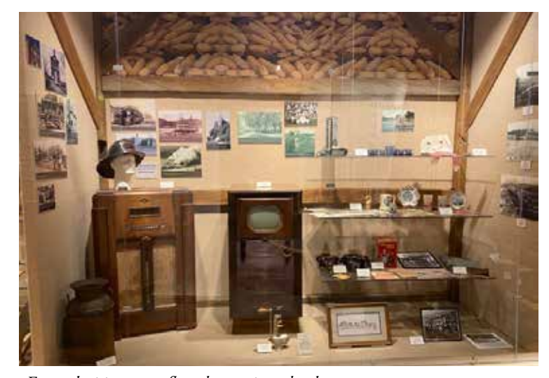
Four television sets reflect changes in technology.