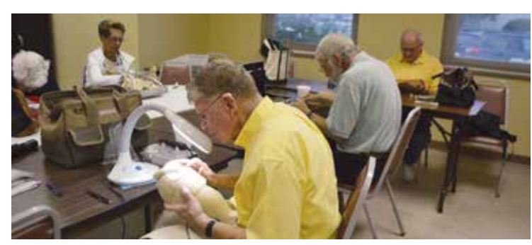
The Anderson Township Senior Center Advisory Committee takes an active role in center affairs.

ensures the Senior Center continues to foster a creative and intellectually stimulating environment that enhances the lives of Anderson seniors.