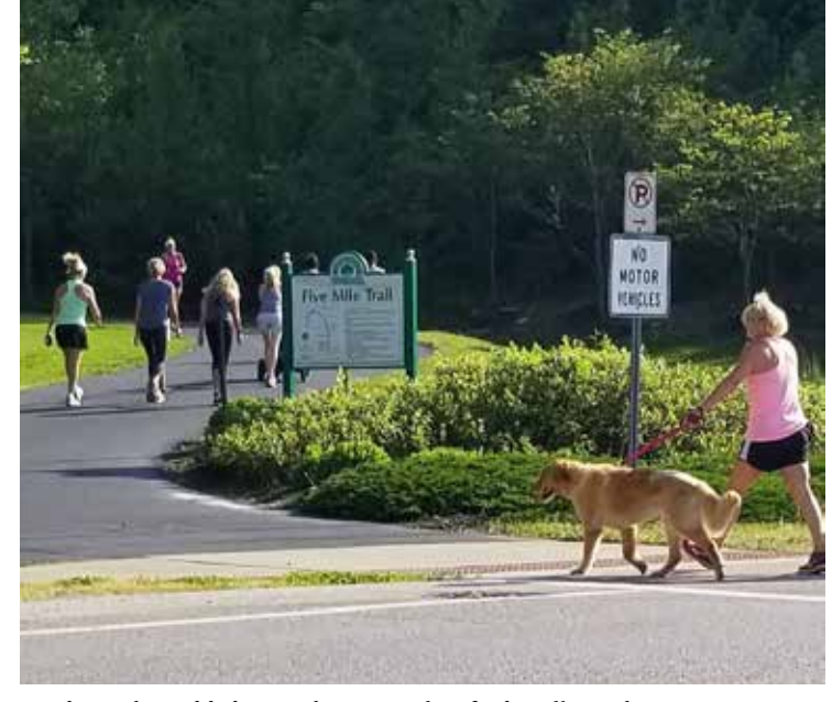
Anderson has added more than 22 miles of sidewalks in the past 25 years.

Volunteers and staff will study segments suggested by residents this fall, and ultimately develop a list of possible projects for review by the community this winter.