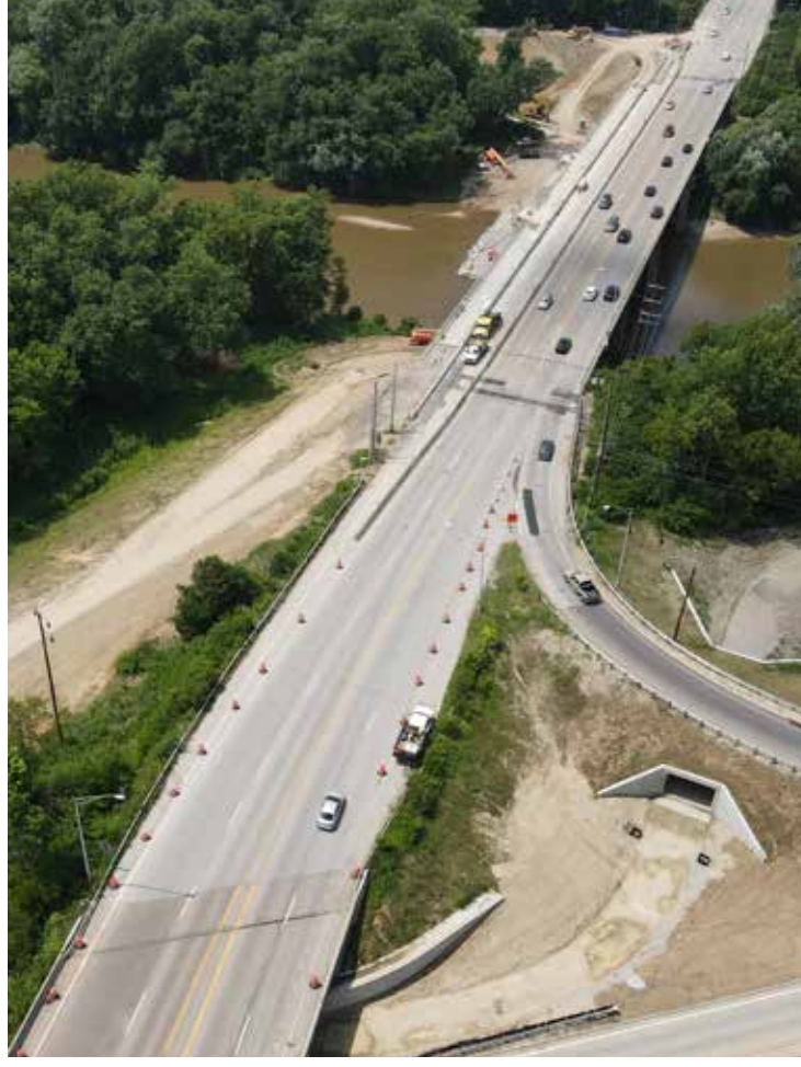
Expansion of Beechmont Bridge will provide trail connections.

"This project has been a long time in the making, so seeing it come to completion is very satisfying."