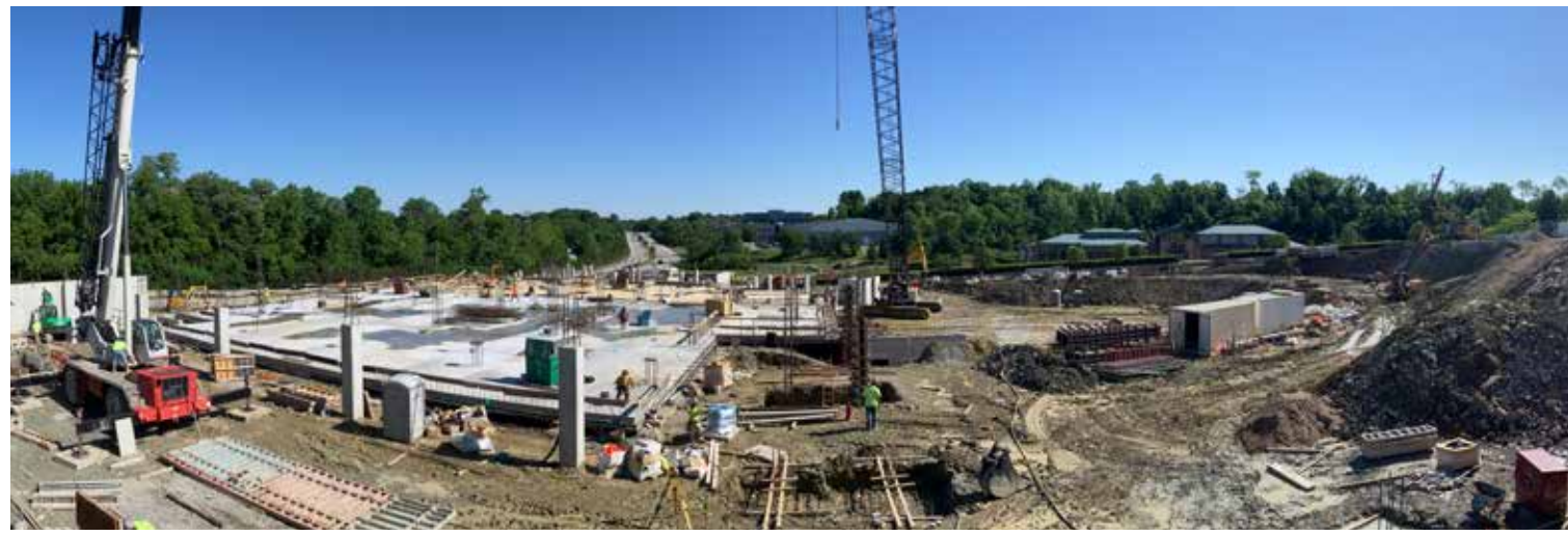
A new apartment community and public parking garage at Vantage at Anderson Towne Center.