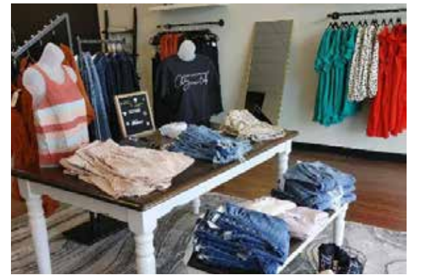
Chic & Honey Boutique

7901 Beechmont Ave. August 2022 23 22 August 2022