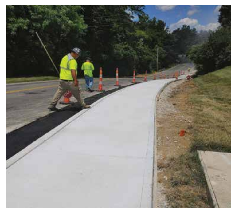
The Bartels Road sidewalk was completed before school was scheduled to start.

A new sidewalk link is under construction on Holiday Hills Drive and also on Clough Pike, in the eastern portion of Anderson. The sidewalk runs along the south side of Holiday Hills Drive connecting