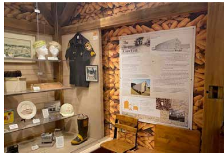
The History Room includes the background story of a local corn crib.

Four televisions from the 1940s to the 1960s: As the television era grew and became one of the defining technologies of the 20th century, four television sets in the room reveal how these were quickly modified in the span of 20 years.