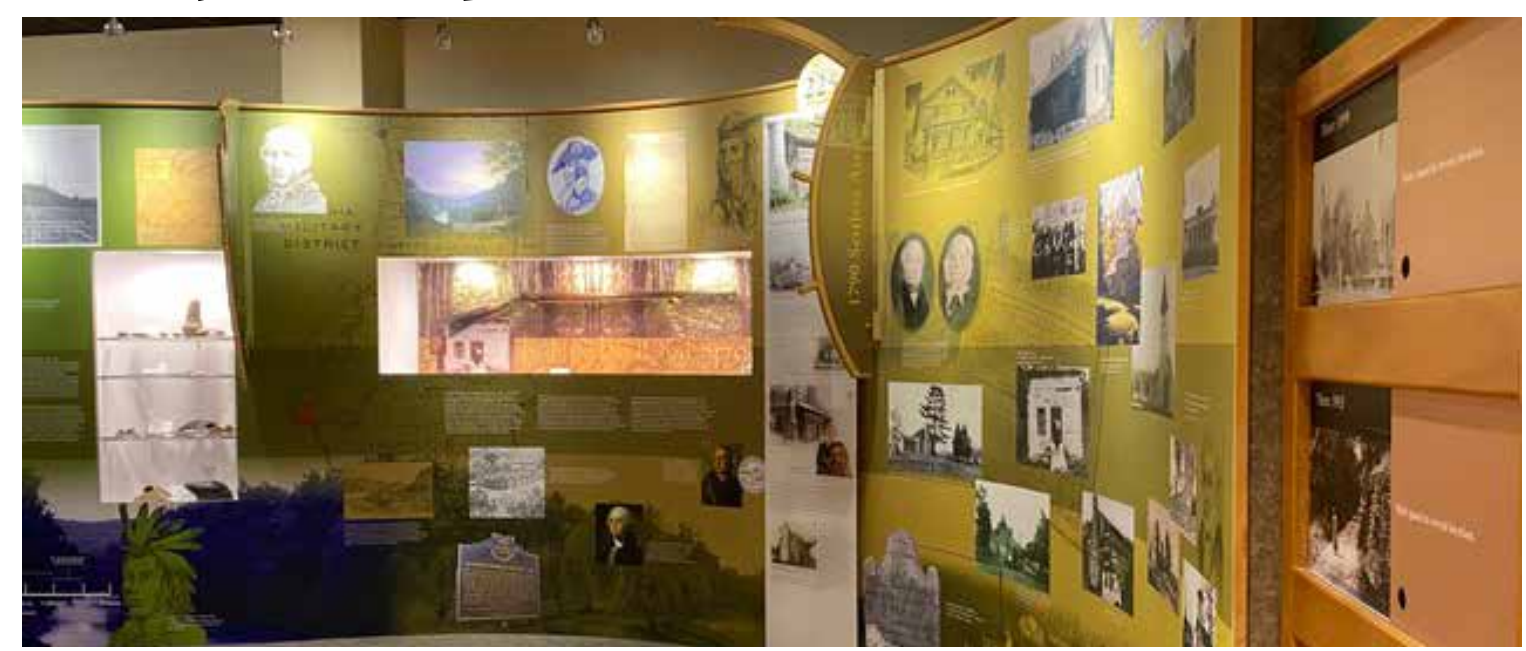
The Anderson Township History Room in Anderson Center

To truly appreciate a place, it helps to know its history. And what better place to learn about Anderson Township than at our very own township History Room?