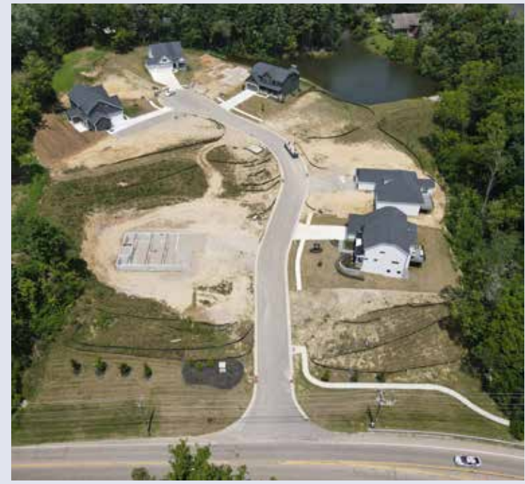
Clough Chase development on Clough by Wolfangel