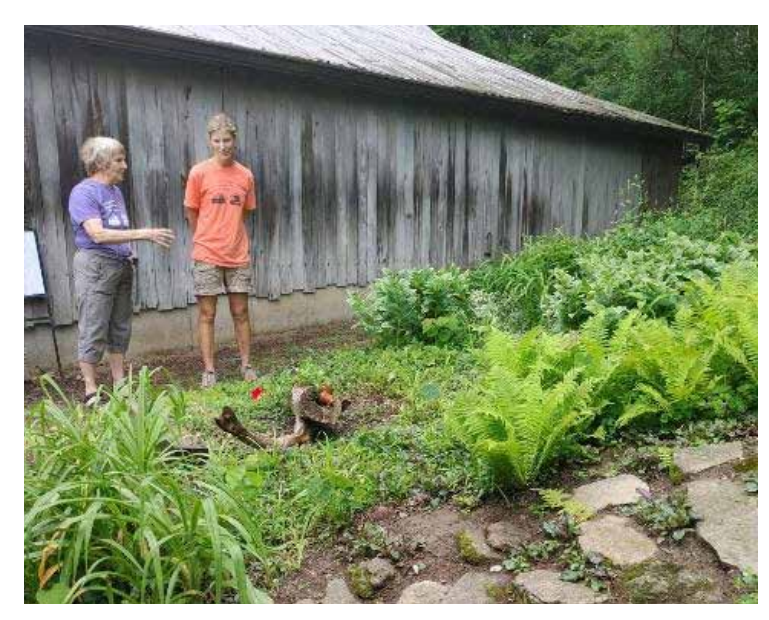
The WeTHRIVE! Anderson Committee sponsors the Anderson Garden Tour.

WeTHRIVE! Anderson Committee - focuses on the social health of Anderson Township. As part of the Hamilton County Public Health's WeTHRIVE! initiative, this committee addresses topics including injury prevention, environmental and social health, community art and community development.