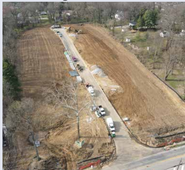
Traditions development on Salem Road