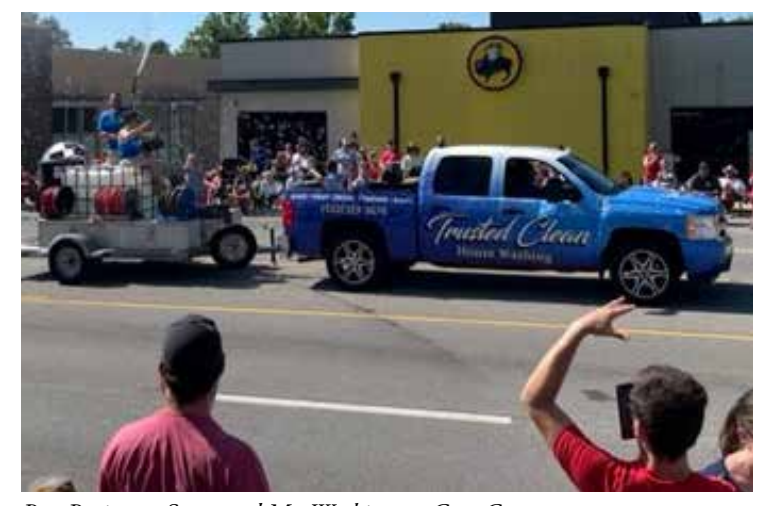
Best Business - Sponsored Mt. Washington Care Center -Trusted Clean House Washing