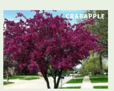
ORNAMENTAL WINNER Crabapple 8116 Ashgrove Drive

Anderson Township has been designated a Tree City USA community since 2009.