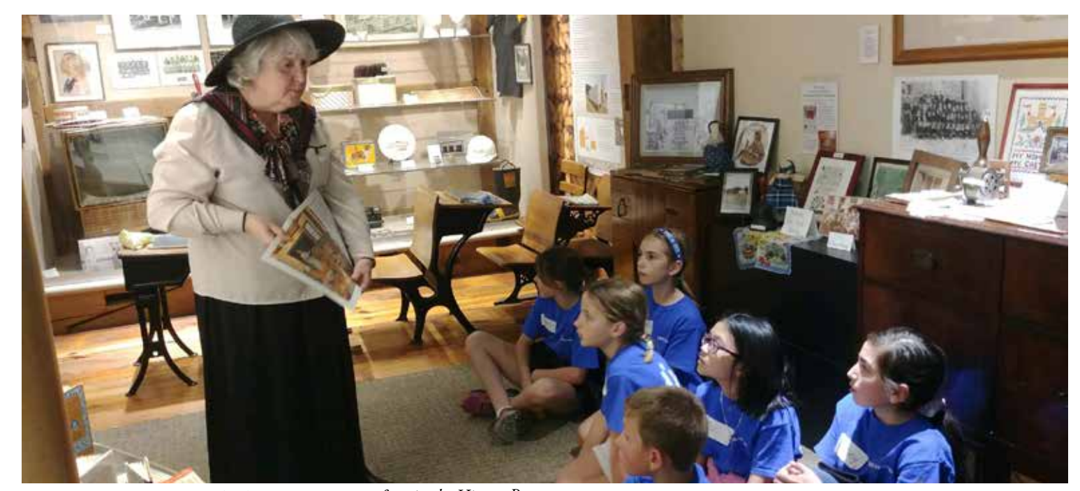
Students in the History to Schools program enjoy artifacts in the History Room.