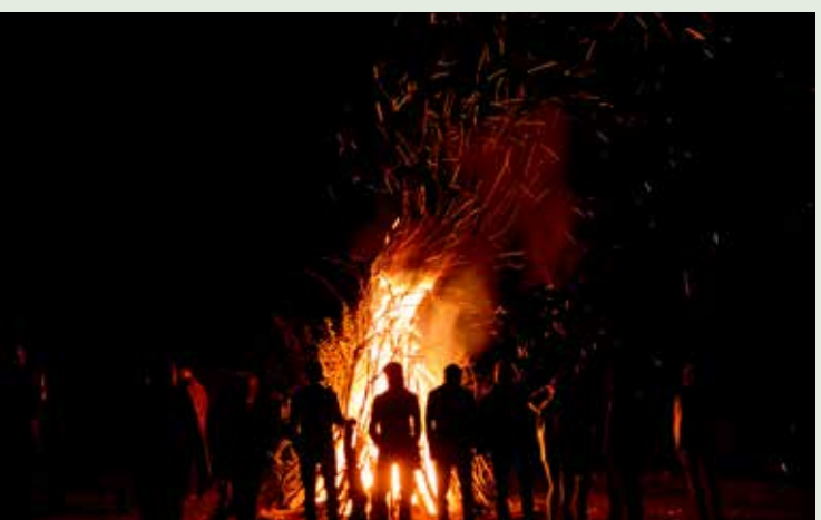
Bonfires are allowed only with a permit.