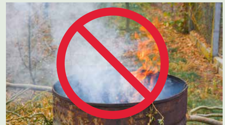
Only burn firewood in a burn barrel, not debris or leaves.

You cannot burn leaves, brush or construction debris in a burn barrel.