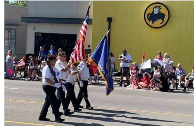
Best Patriotic - Sponsored by Rapid Mortgage - American Legion Post 318- Sons of Legion