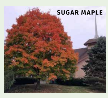
FALL COLOR WINNER Sugar Maple 2010 Wolfangel Road

Property owners receive a commemorative plaque and public recognition by Anderson Township trustees.