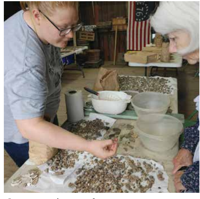
Community members sort artifacts.