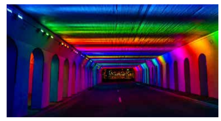
Proposed changes for the I-275 underpass involve colorful lighting.

Improvements and future maintenance would be paid for by a combination of the township's Tax Increment Financing (TIF) funds.