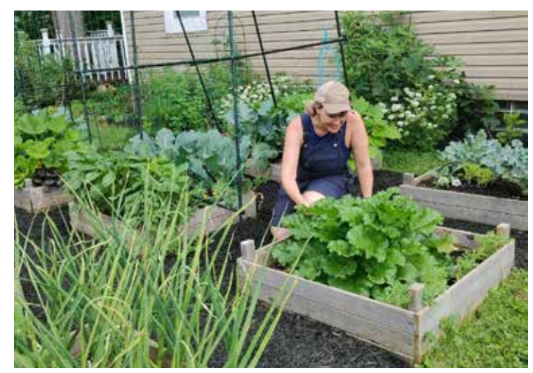
Great American Cleanup